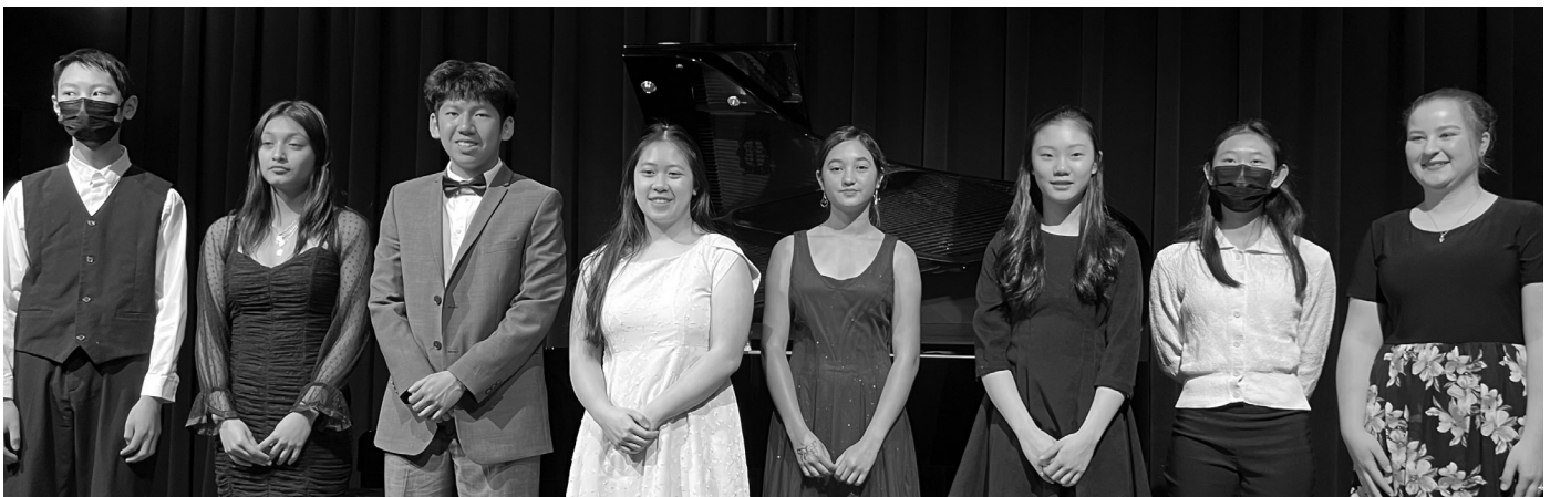
PSF students at 2023 Spring Recital.