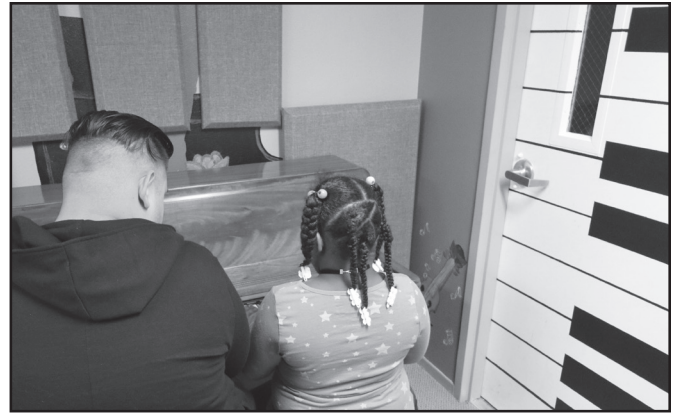
A student taking lessons at Step Up Southeast.