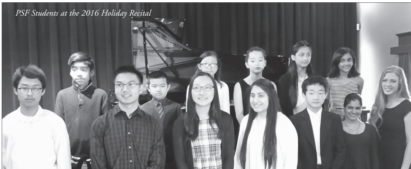
PSF Students at the 2016 Holiday Recital