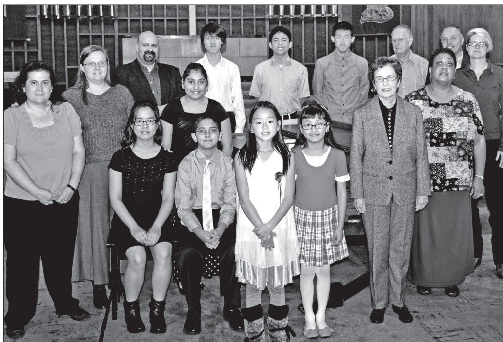
Students, Board Members and Volunteers at the Dress Rehearsal in November 2013.

Saturday, Dec. 6, 2014 Reception to follow.