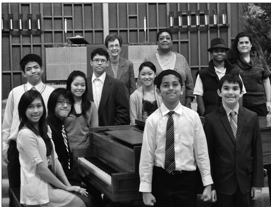
2011 Piano Santa Foundation Holiday Recital

Saturday, Dec. 1, 1:30pm Central Lutheran Church 1820 N.E. 21st Ave., Portland 97212 Reception to follow.