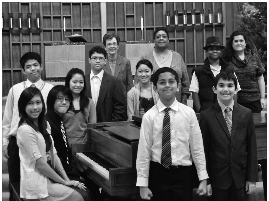
2011 Piano Santa Foundation Holiday Recital

Saturday, Dec. 1, 1:30pm Central Lutheran Church 1820 N.E. 21st Ave., Portland 97212 Reception to follow.