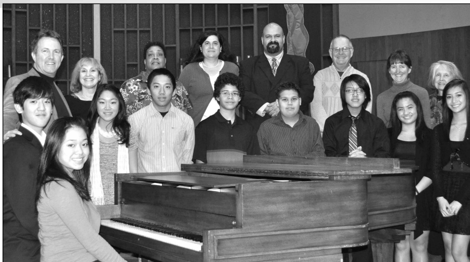
2010 Piano Santa Foundation Dress Rehearsal

Saturday, Aug. 13, 2011, 1:30pm Central Lutheran Church 1820 N.E. 21st Ave., Portland 97212 Reception to follow.